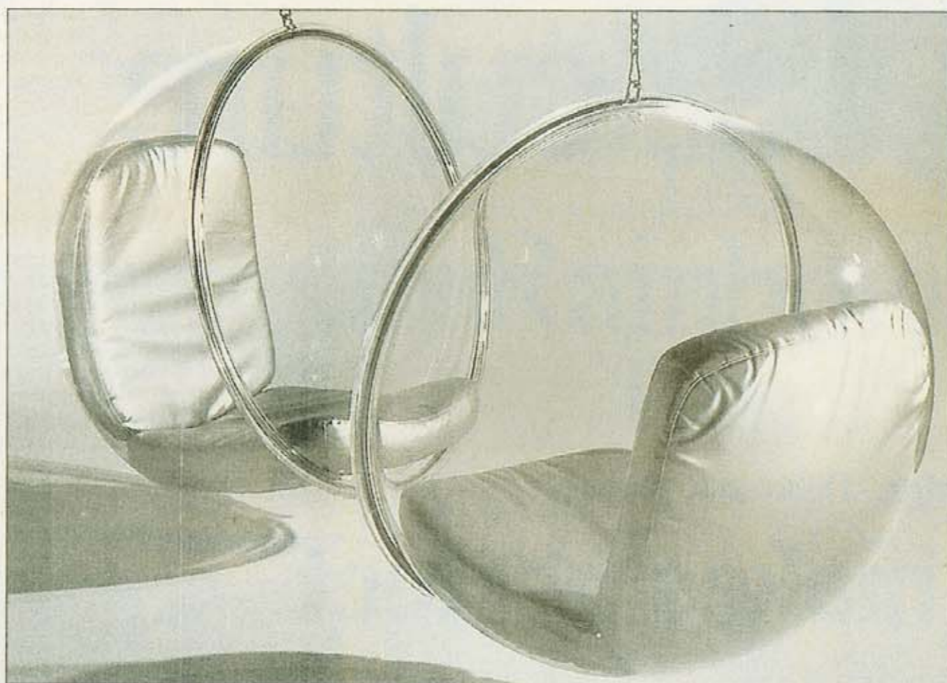
Finnish designer Eero Aarnio's Bubble Chair (above) and Formula Chair (left) are arranged as if in an expansive living room (lower right) in the Embassy of Finland's exhibition of his work.

Featured are not one, but three Ball Chairs under a big poster of Mr. Aarnio lounging in his design and talking on a phone wired into the side. The red-and-black Ball Chair on display turns out to be a re-